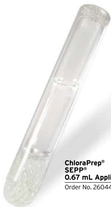
ChloroPrep ® SEPP ® 0.67 mL Applicator Order No. 260449

Proven solution. Proven applicators. Proven outcomes.